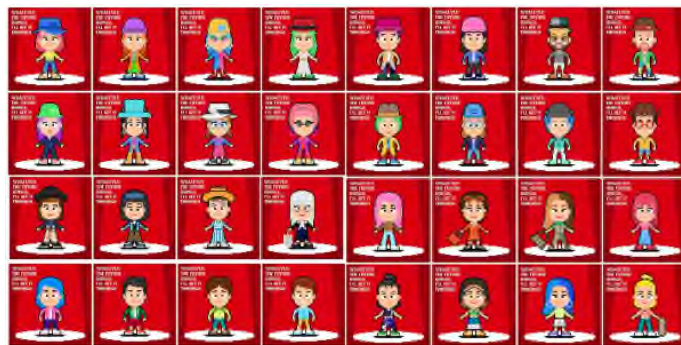
Photo 3: HSBC will send 1,000 customer gifts in the form of eco-friendly, non-tradable NFTs. Issued by a third party digital platform, these NFTs will be the first-ever digital collectibles from a retail bank in Hong Kong