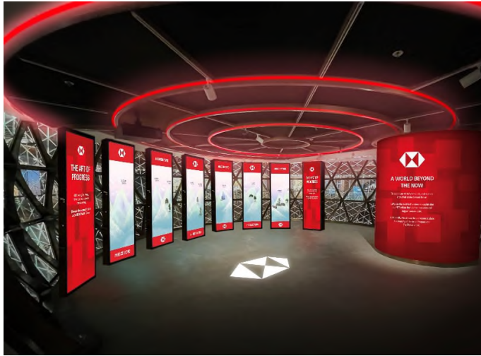
Photo 1: HSBC is partnering with K11 MUSEA to introduce one of the largest and most diverse NFT exhibition in Hong Kong. Two NFT art pieces from HSBC will also be presented at the exhibition.