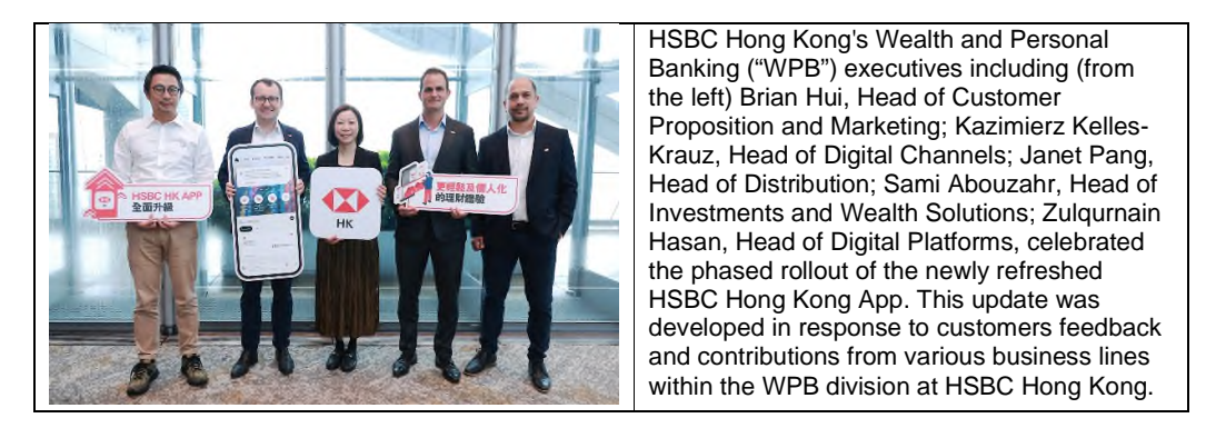
What we've freshened up in the HSBC HK App